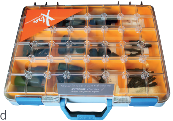
product may differ to photo

Designed to make life easier for installers and service engineers! With compartments chosen by you, this really is an essential piece of kit to have near. The toolbox comes with an illustrated guide on an outer card die-cut case, plus refill information.